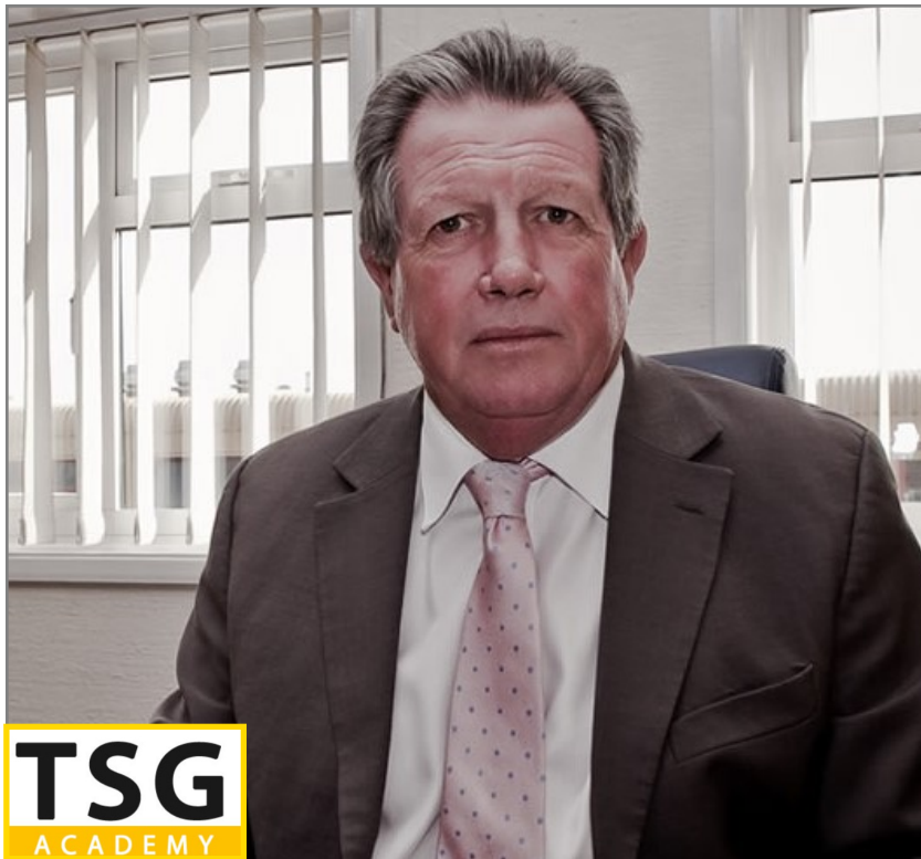
"TSG Academy - The Peter Thrussell Centre for Training and Excellence"